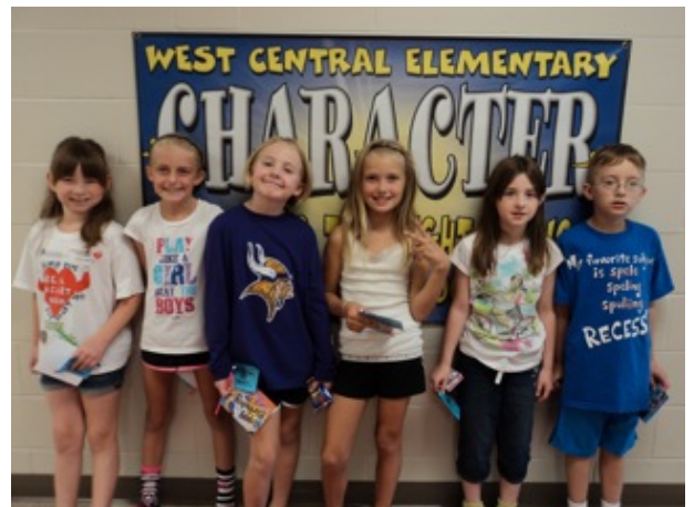
September Second Grade Birthdays